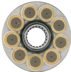
YELLOW METAL PISTON SHOES