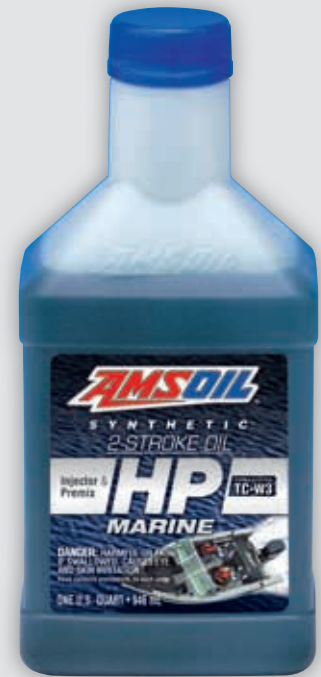
NMMA TC-W3 API TC

HP Marine is formulated with MAXDOSE™, a system of advanced additives for "super-clean" operation. It helps prevent deposits that lead to poor performance. In field testing, HP Marine inhibited ring deposits that can cause ring sticking and ring jacking (carbon build-up behind the ring, forcing it outward), a phenomenon that occurs in modern DFI outboard motors. It also virtually eliminated exhaust port deposits for reliable, efficient operation.