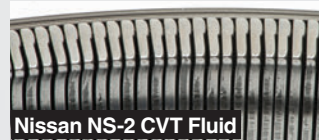
Nissan NS-2 CVT Fluid