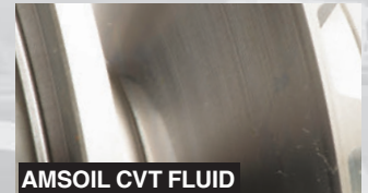
AMSOIL CVT FLUID