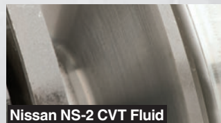
Nissan NS-2 CVT Fluid